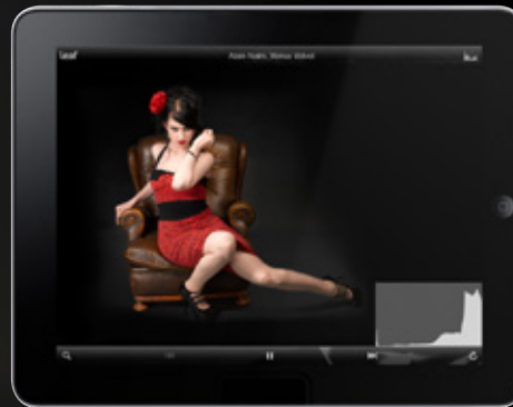
Capture Pilot and Camera Control